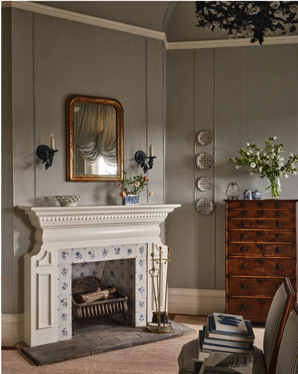
The “Delft Dreams” bedroom with a corner fireplace by Chantal Lamberto of Chantal Lamberto Interior Design