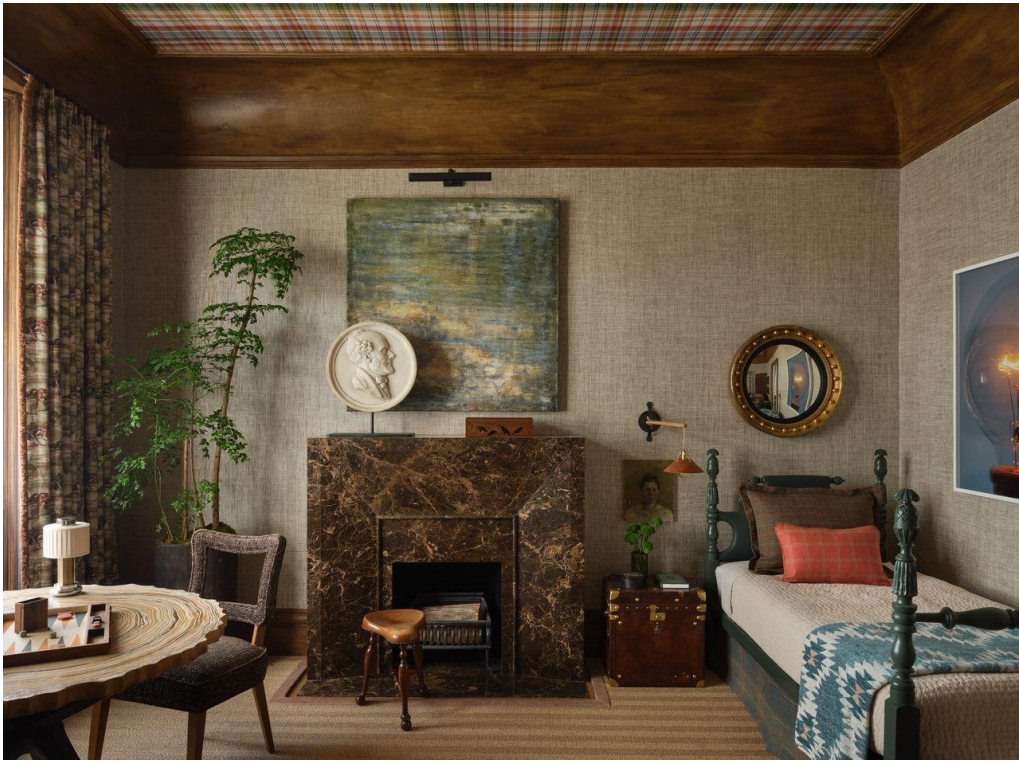
The “Double Standard” bedroom by Jeffrey Neve of Jeffrey Neve Interior Design . Photo: R. Brad Knipstein