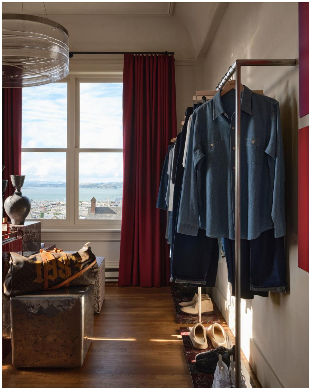
The primary dressing room called “West | Red Dressing Room” by Fernando Castellanos of Castellanos Interiors